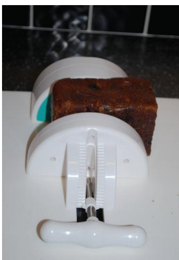
Clamp – useful for cutting.