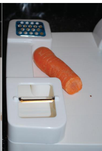
Grater & Peeler.